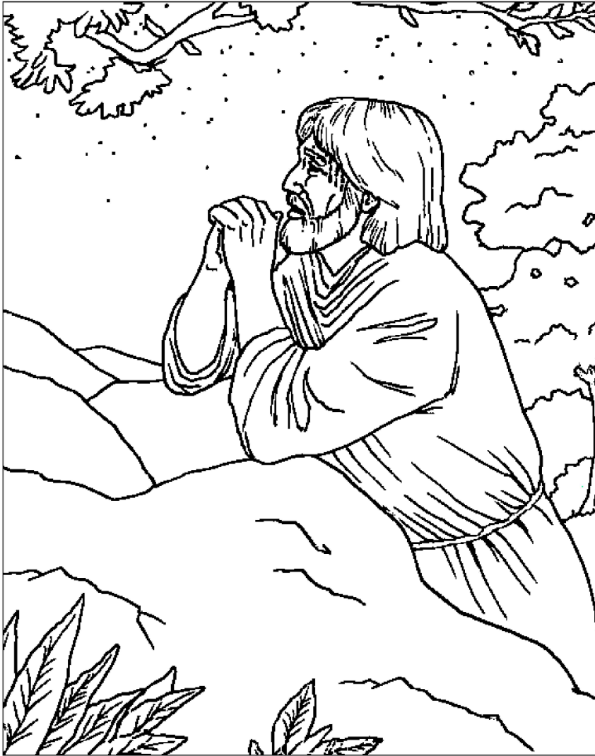
Jesus Prays for His Disciples

From BibleStoryCard Learning System'M Coloring Book© 1996 Wesleyan Publishing House Used by permission. Additional resources available by calling 1-800-493-7539 or visiting on line. https://wphstore.com/