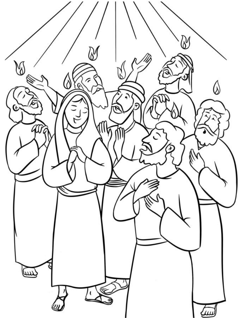
The Day of Pentecost Acts 2