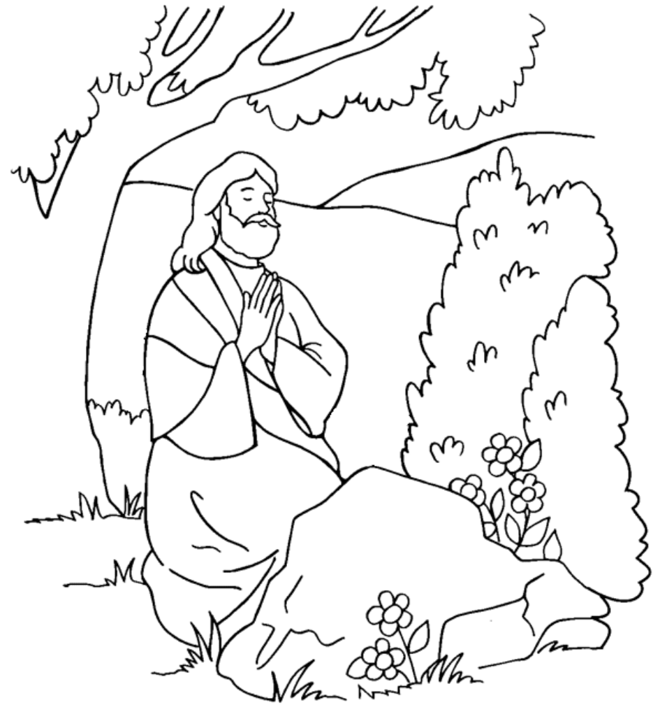
Jesus Prays for All Believers

From Thru-the-Bible Coloring Pages for Ages 4-8. © 1986,1988 Standard Publishing. Used by permission. Reproducible Coloring Books may be purchased from Standard Publishing, www.standardpub.com , 1-800-323-5473.