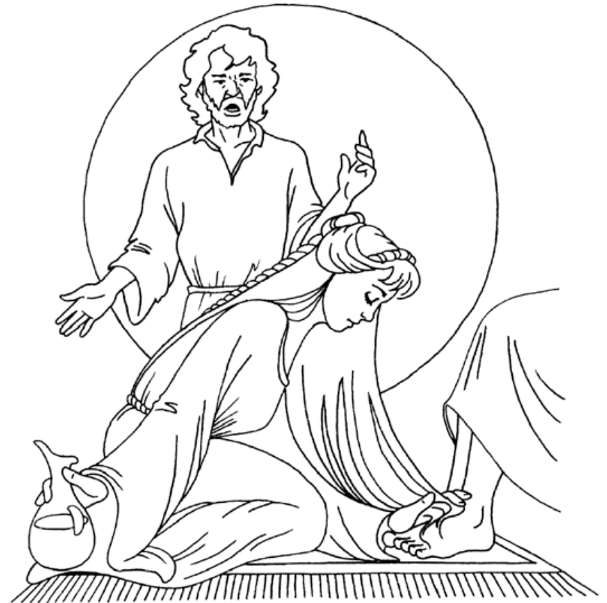
Mary Anoints Jesus' Feet John 12:1-8