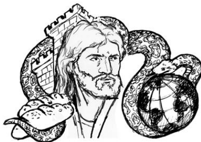
The Temptation of Jesus