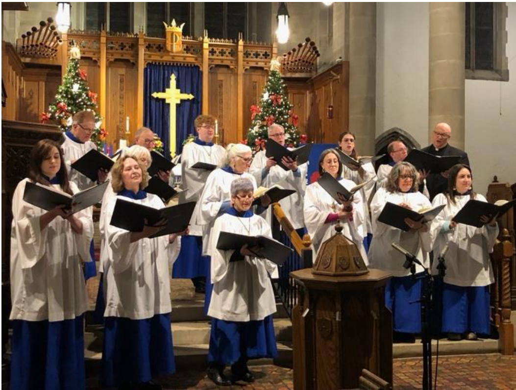
The choir, which included several members of our collaborating Lutheran neighbors, sang "Night of Silence," "In the Stillness," "The Virgin's Slumber Song," and "The King Shall Come."