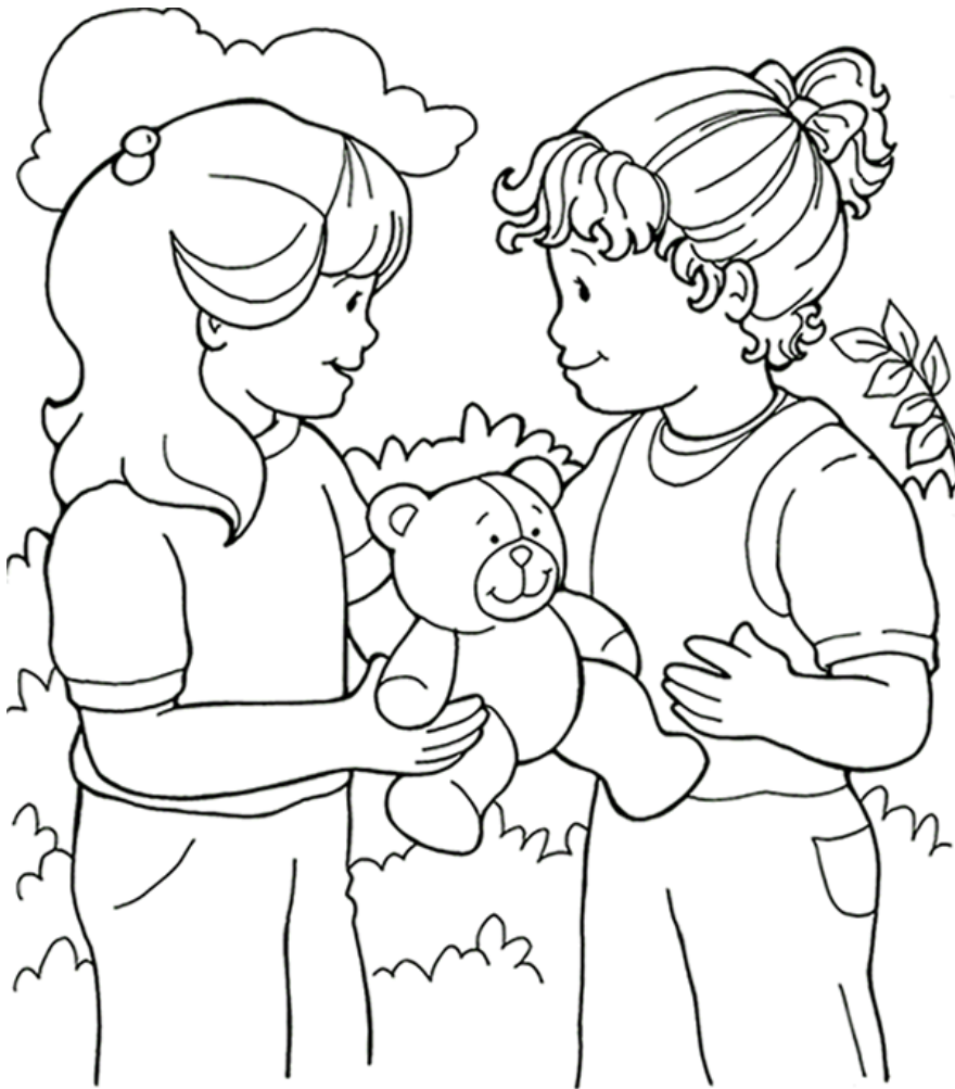
I can follow Jesus by sharing.

From Thru-the-Bible Coloring Pages © Standard Publishing. Used by permission. Coloring Books may be purchased from