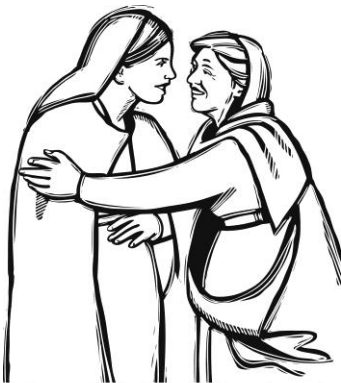
Mary Visits Elizabeth

May be reproduced for Ministry Use