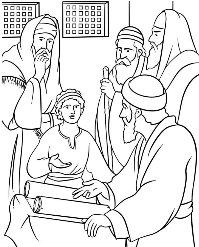
Jesus in the Temple Luke 2