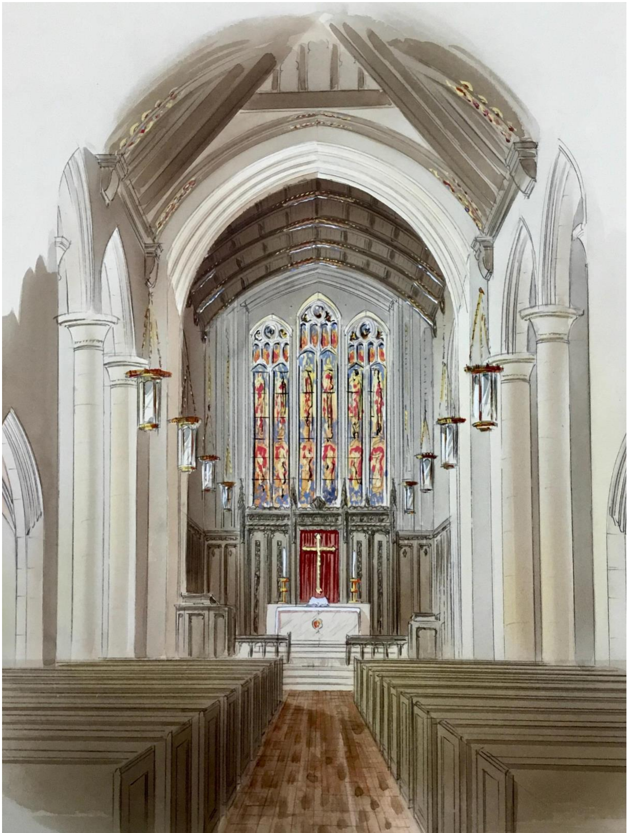
The architect's drawing from "The Studios of Potente, Inc., Kenosha, Wisconsin."