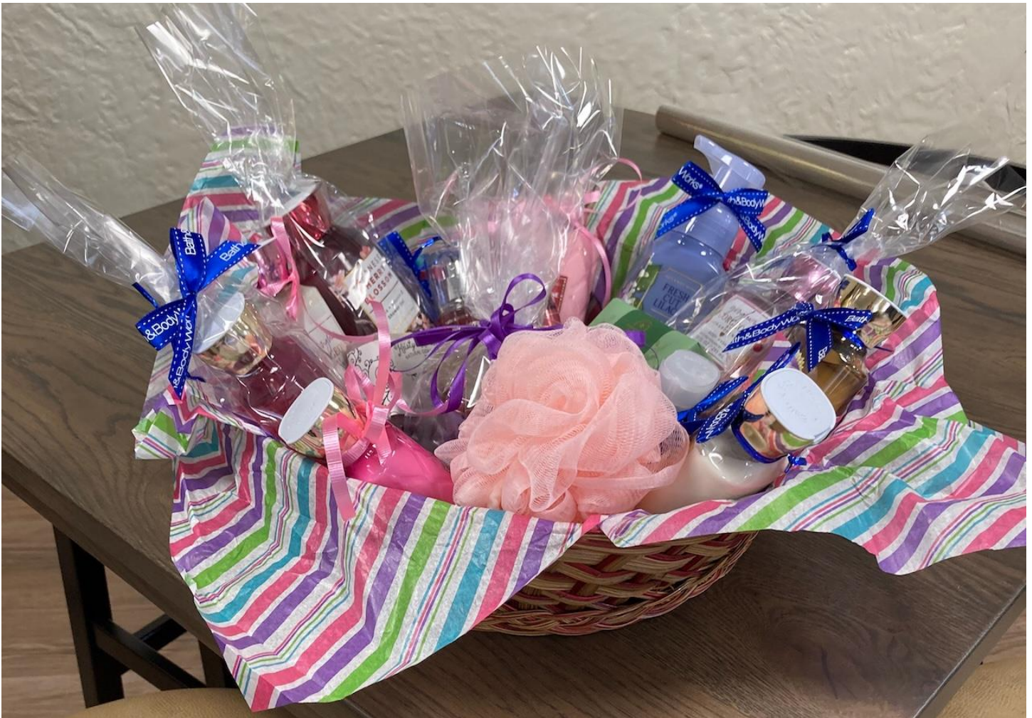
One of the many gift baskets available.